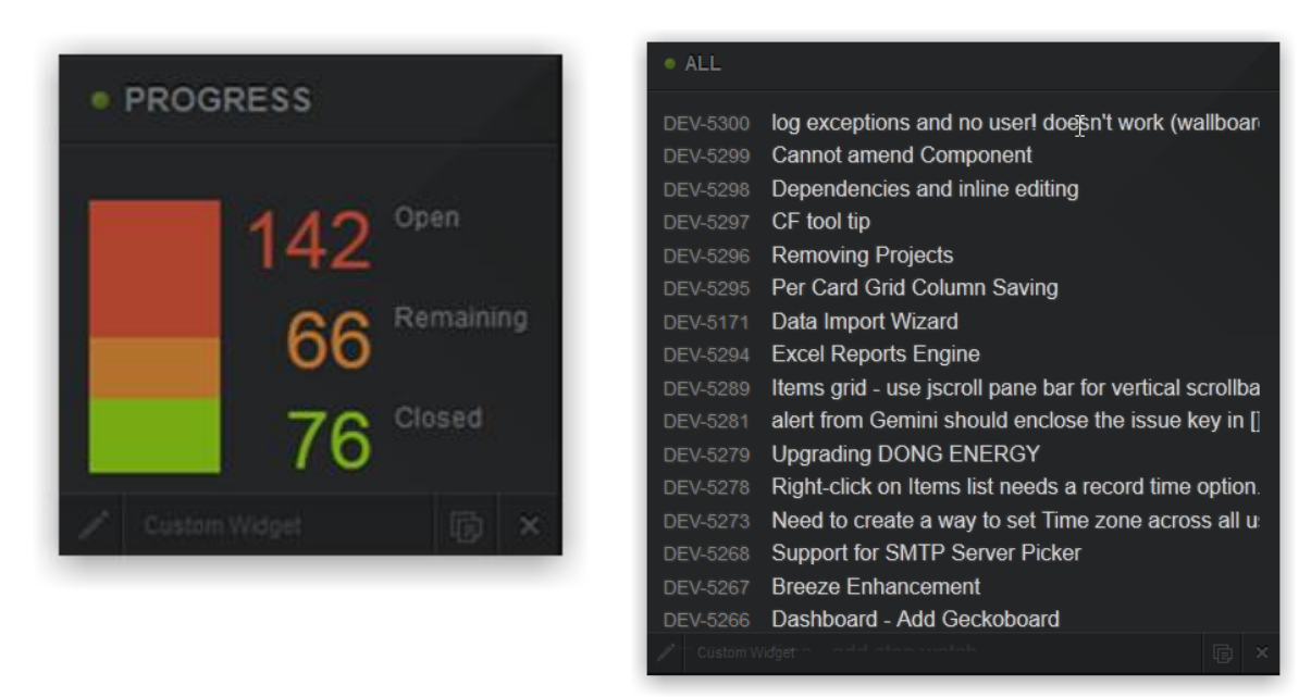
Fig 6.0 Samples widgets from a Geckoboard integrated with Gemini

For more information on the Gemini Geckoboard integration and how to set your Geckoboard up see the documentation <u>here</u>.