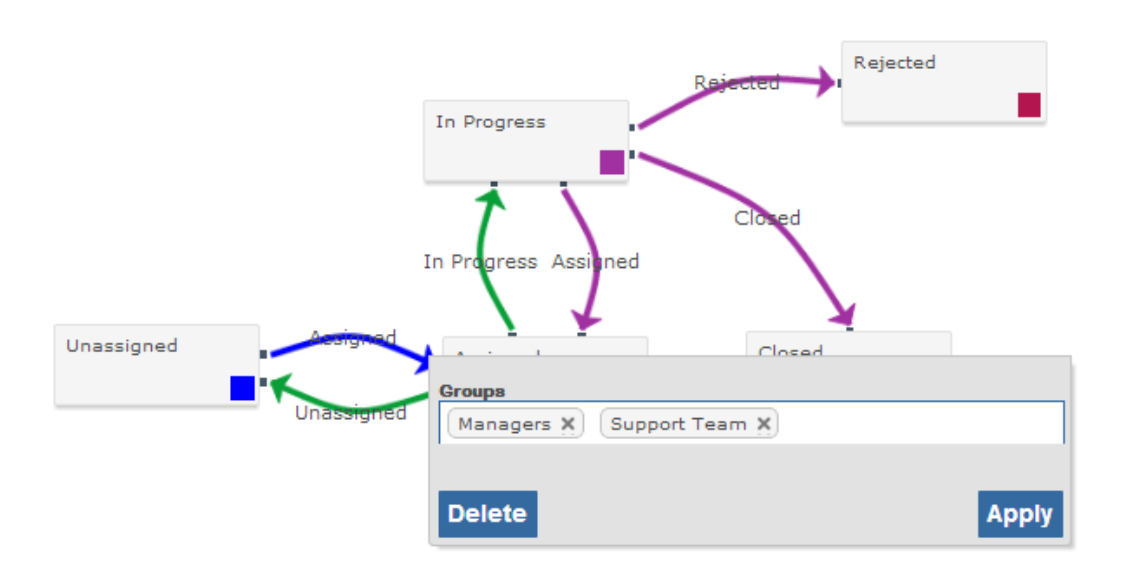
Fig 1.1 Example Workflow showing a status transition being restricted to certain User Groups.

Click <u>on the arrow</u> that marks the transition from one status to another and you will see that you can delete the transition; you will also see the same User Group selector as when you clicked on the person icon in Screens (Step 1). Gemini lets you drag-drop draw Workflow but also lets you define which groups of users are allowed to change the status of an item and from which values. You could, for example, define a group of approvers and then only allow members of that group to set the status Approved, which might be a pre-cursor to development, deployment or closure of the task.